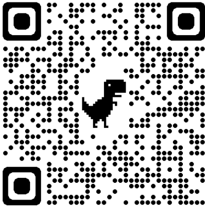
Sale Notice QR